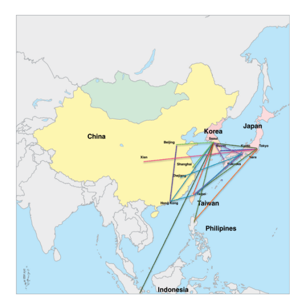
FIG. 2.—MOBILITY OF FILMMAKING SOJOURNERS IN ASIA

in Japan. Inversely, participant Q is a Japanese worker based in South Korea. These participants were able to provide much information and many insights about the culture and working environments of film co-production sites in South Korea, Japan, and China.