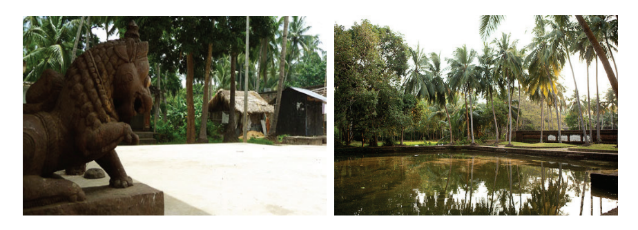
Fig. 2.—Raghurajpur handicraft village in Orissa

Raghuraipur-a model of development based on cultural values and arts near Puri. It is being considered as a world heritage village and is the basis of the economic, social, and cultural life of the area.